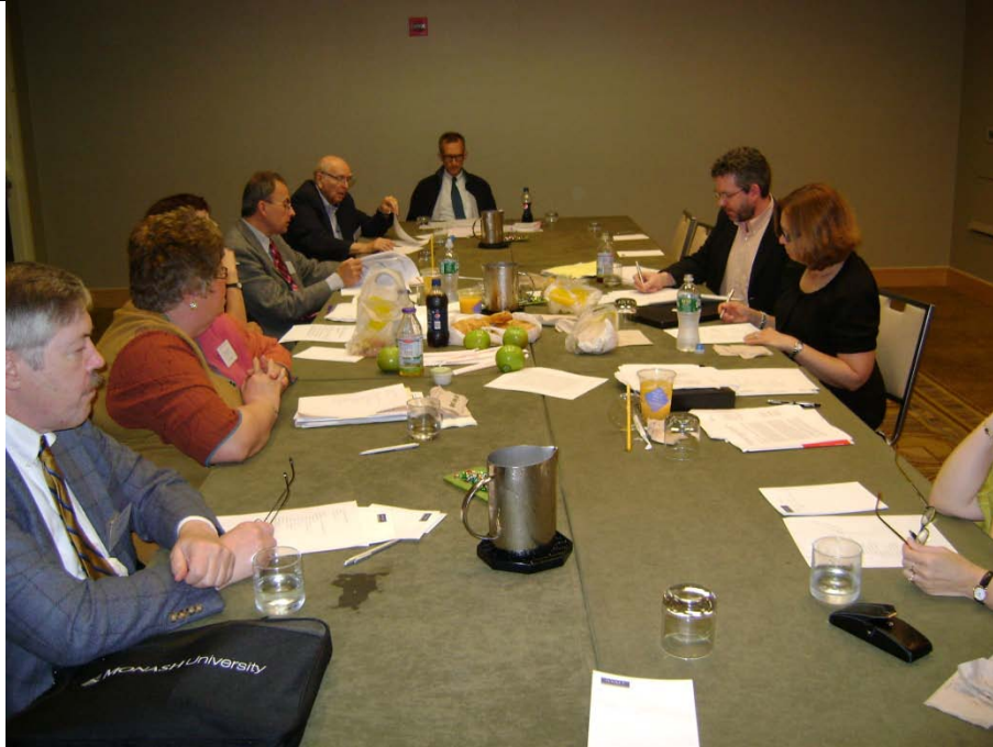
The Polish American Historical Association Board met in New York in June 2009.

Remember that you can always renew your membership online!