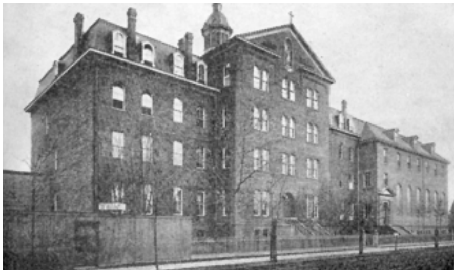
SS. Cyril and Methodius Seminary, Detroit

January. She has been invited to serve as a guest lecturer in the Dept. of Education at Loyola University, discussing oral history as a source for research, as well as presenting "Community-Based Education: Polish Saturday Schools" at PIASA's annual conference in June 2002.