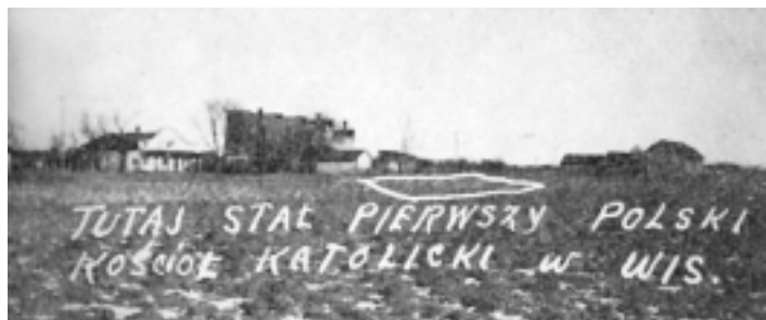
Poland's Corner, Wisconsin

Immigration and Ethnic History Society: October 30-November 2, 2003, New York University. Theme: "Transcending Borders: Migration, Ethnicity, and Incorporation in an Age of Globalism." www.iehs.org/Conferences.htm