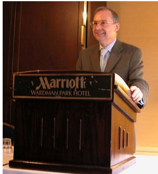
His Excellency Przemyslaw Grudzinski, Ambassador of the Republic of Poland opens the PAHA Annual Meeting, at the Marriott Wardman Park in Washington, DC, January 8, 2004

The conference also featured a behind the scenes look at Milwaukee Art Museum Exhibition on Polish Art and a documentary on sculptor Louis Dlugosz.