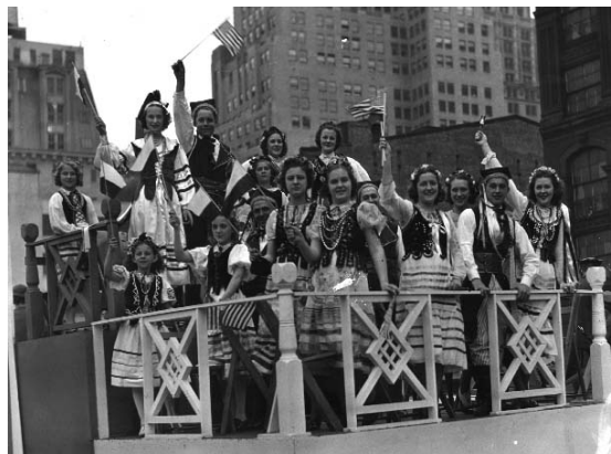
Pulaski Day Parade. New York City. 1939

For more information, contact Office of External Relations of the College of Liberal Arts, University of Minnesota at (612) 625-5031 or govro003@umn.edu. Send contributions to the IHRC at the Elmer L. Andersen Library - 222-21st Avenue South, Suite 311 - Minneapolis MN 55455, on the West Bank campus. (612) 625-4800