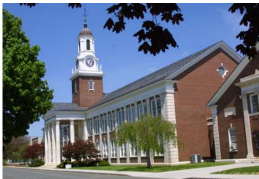
Davidson Hall, Central Connecticut State University, New Britain, CT.